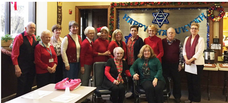
Members of Women's Club were joined by members of the Combined Chorus to bring the Holiday spirit to the Adult Day Care at the Methodist Church.