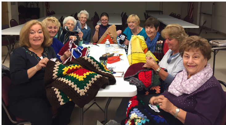
Sewing labels on lap robes for the General Needs program. Robes will be given to homeless veterans on Long Island.