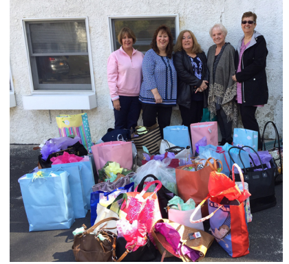
More than 80 pocketbooks filled with gifts were delivered to Madonna Heights for Mother's Day.