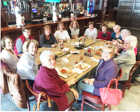
Book Club Discussion - My Notorious Life - at the Nutty Irish. 13 members attended!

EXECUTIVE BOARD MEETING - SEPTEMBER 21ST - 10:00 AM