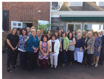
Jr. League 75th Anniversary with members of Women's Club who attended the luncheon.